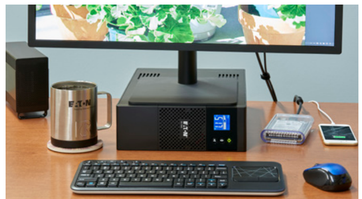
Convenient form factor: use as a desktop monitor stand to fit in confined spaces.