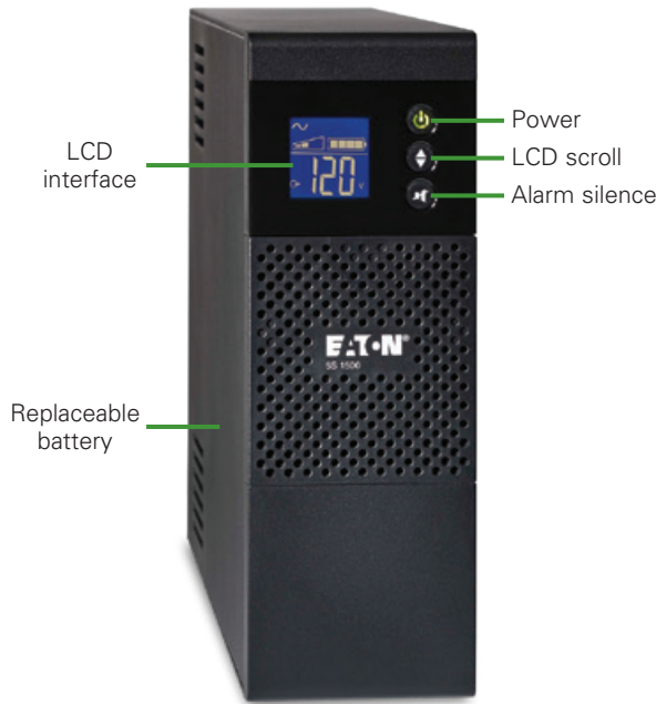
Model displayed above: 5S1500LCD